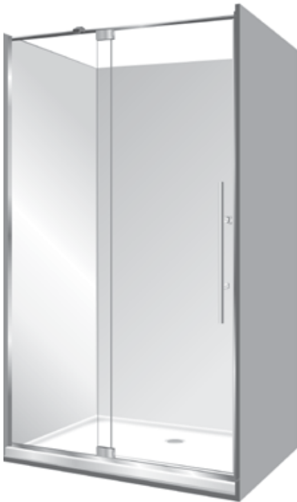
Alcove 1000 x 1200 x 1000 Silva FW